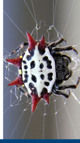
SPINY ORB WEAVER SPIDER